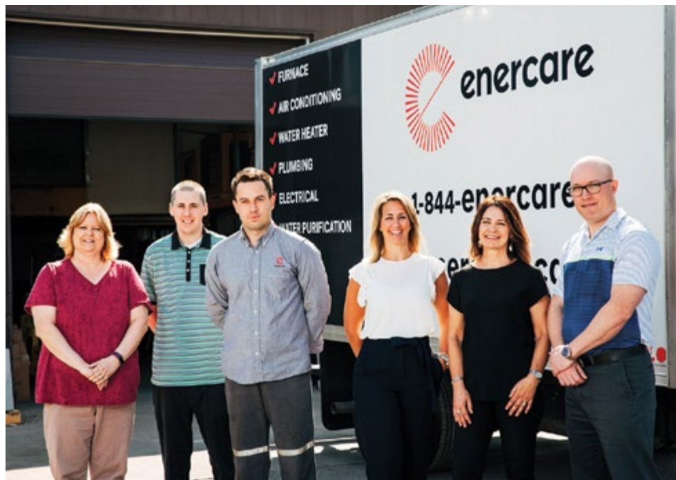
Perry Mechanical Team